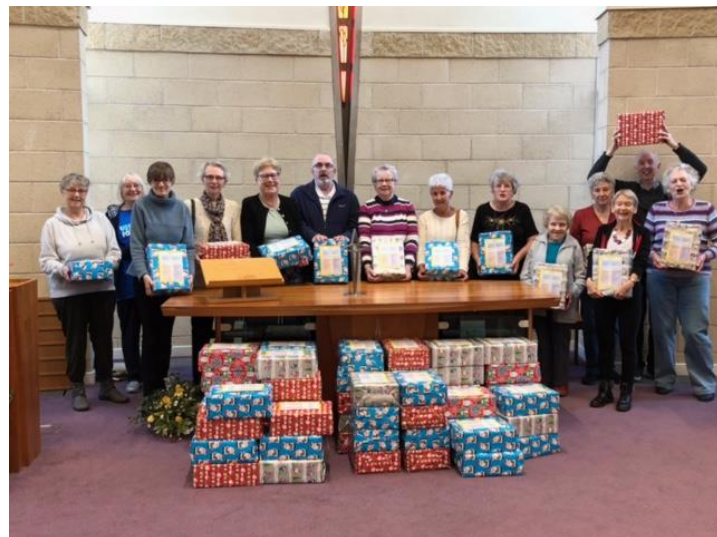
Shoe box Appeal = 2022