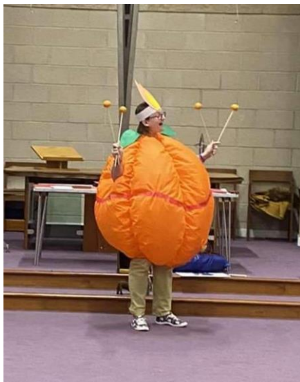
Christingle Service Dec 2022