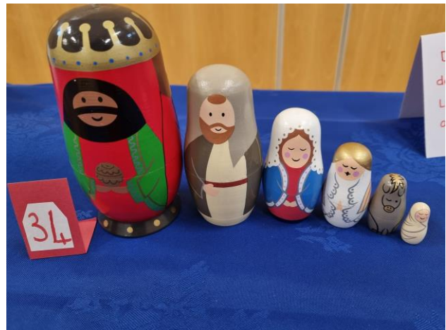
Nativity Festival Dec 2022